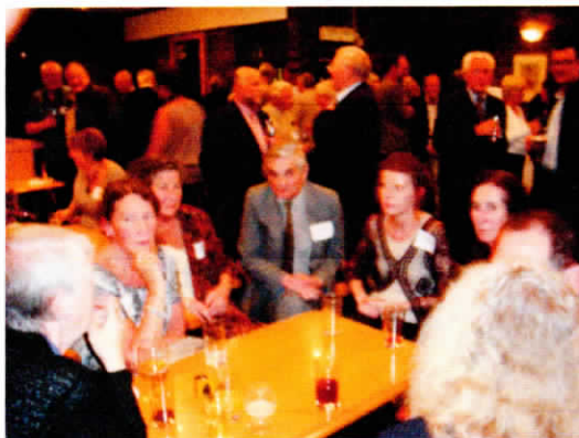
Part of the gathering ~ the nearest thing we could get to a group photo