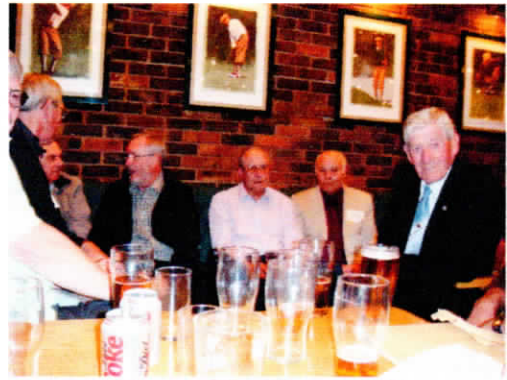
Men with Glasses !!