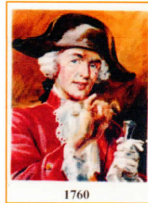
The old Guv'nor, God Bless him !