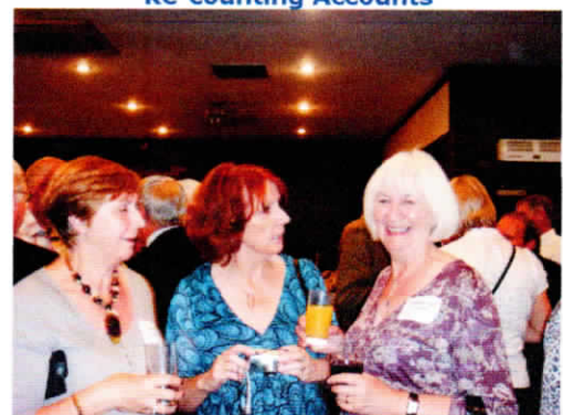
Talking about the old times !