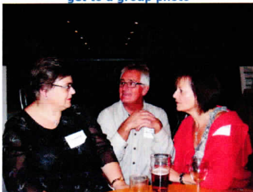
A rose between two thorns