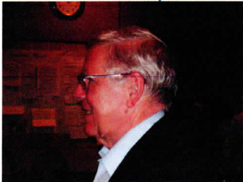
One the original there were numbers under this photo but we didn't have room to include them